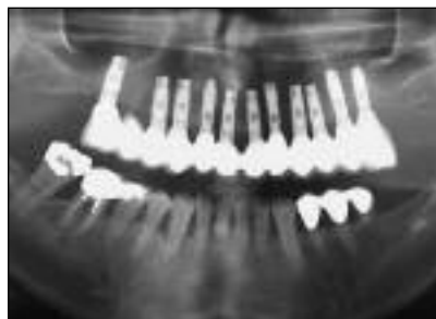
Fig 2 Panoramic view of the reconstructed maxilla after 3 years in function.